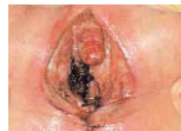
Figure 2: De-epithelialization of the clitoris in VIN III (vulvar intraepithelial neoplasia)

The surgical approach should be tailored to preserve the patient's ability for cohabitation and to reach orgasm. This is especially challenging if the malignancy is located in the vicinity of the clitoris. In some cases of pre-invasive cancer, the exclusive removal of clitoral skin is possible and the defect can be covered with reconstructive measures. (Fig. 2) (Terlou et al. 2008). As an extensive vulvectomy may cause severe strictures of the introitus, reconstructive surgery with placement of flaps should be performed in order to limit the risk for such consequences (Fig. 3a-c).