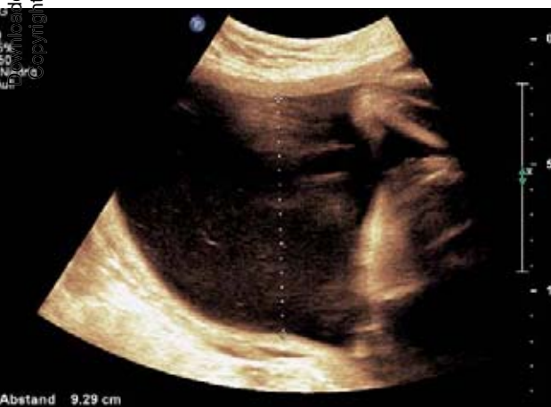
Figure 1: Polyhydramnios

Variances from the normal amount of amniotic fluid can give rise to maternal or fetal diseases. A hydramnios or polyhydramnios (Fig. 1) is defined as more than 2000ml of amniotic fluid. Reasons can be fetal swallowing disorders, esophageal atresia, tracheal stenosis, cerebral malformations and maternal diabetes. If the total amniotic fluid is less than 100ml, this is termed oligohydramnios. The absence of amniotic fluid is called anhydramnios. Reasons for a reduced amount of amniotic fluid can be, amongst others, pathologies of the fetal urogenital system (kidney malformations and renal aganesis, urogenital tract disorders). However, it is important to exclude a ROM in these cases.