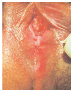
Figure 8: Folliculitis in a 23-year-old patient